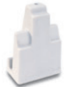
Finishing Connector Smooths out the dock edge