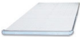
Gangway 4' x 4', 4' x 8' and 4' x 12' sizes Pre-assembled panels and light weight aluminum frame