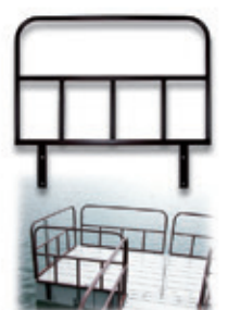
Guardrail For safety