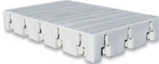
Float Section FS2120 2000 Series – High Profile

45" x 60" x 10" (114.3 cm x 152.4 cm x 25.4 cm) Maximum flotation: 690 lbs (313 kg) per module Freeboard: 8" (20.32 cm) above the water