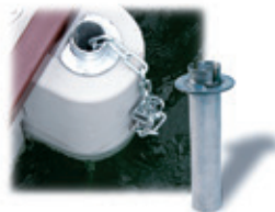
Dead Man Collar Fits into pole connector