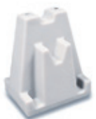
Float Connector Connects float modules together