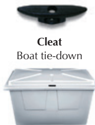
Cleat Boat tie-down