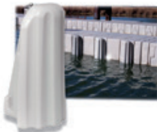
2000 Series Bumper Attaches in the float section sockets