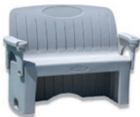
2000 Series Bench Designed to seat two people comfortably