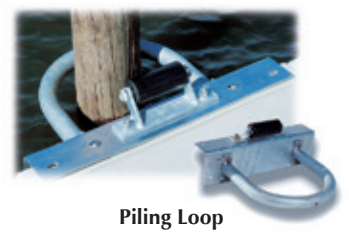
Piling Loop Anchors to existing piling poles