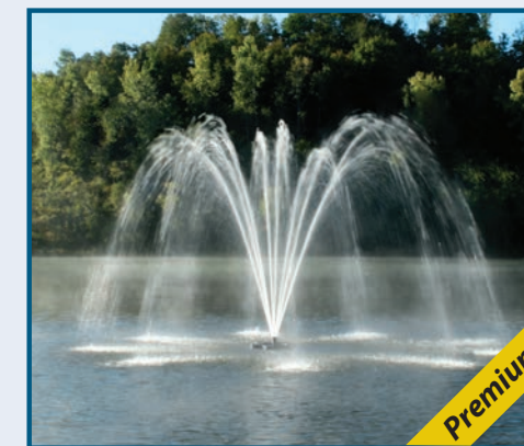
K PALM - 3 HP