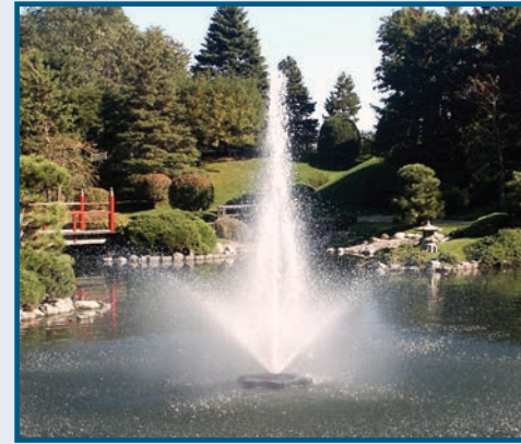
A LINDEN - 2 HP

COMPLIANT AND WARRANTED — Kasco fountains are approved to UL and CSA standards by ETL as complete packages. Each 3/4 and 1 hp fountain comes with a 2-year manufacturer's warranty and 2, 3, and 5 hp fountains include a 3-year warranty.