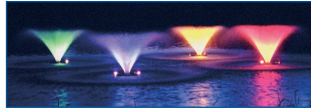
LR Light Kits with colored bulbs (50-watt) in red, green, blue, or yellow.

Decorative light kits add beauty and interest to your aerated pond. The superior design of Kasco lighting sets a new quality standard that competitors attempt to achieve!