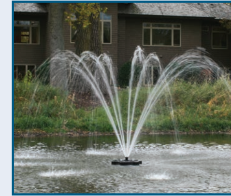
B CYPRESS - 1 HP