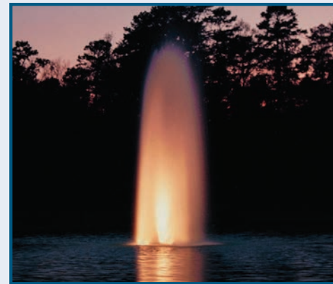
G SEQUOIA - WITH LIGHTING - 5 HP