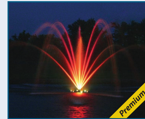
I MAGNOLIA - WITH LIGHTING - 3 HP