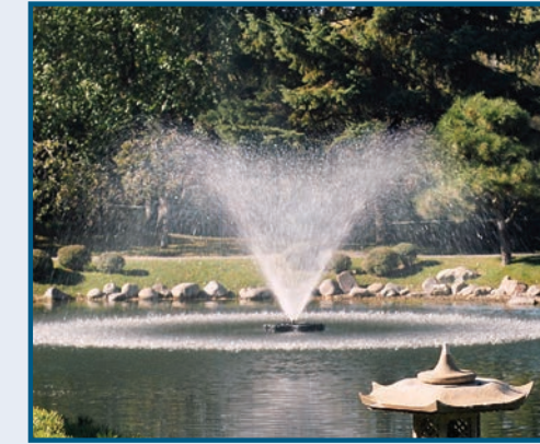
C WILLOW - 2 HP