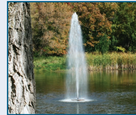
E REDWOOD- 2 HP