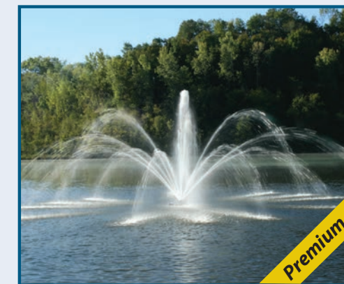
L MAHOGANY - 3 HP