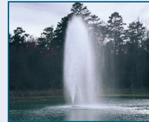
F SPRUCE - 3 HP