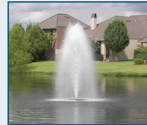
H BIRCH - 3 HP