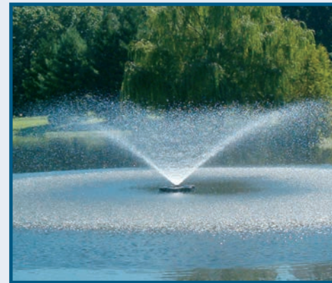
D JUNIPER - 2 HP