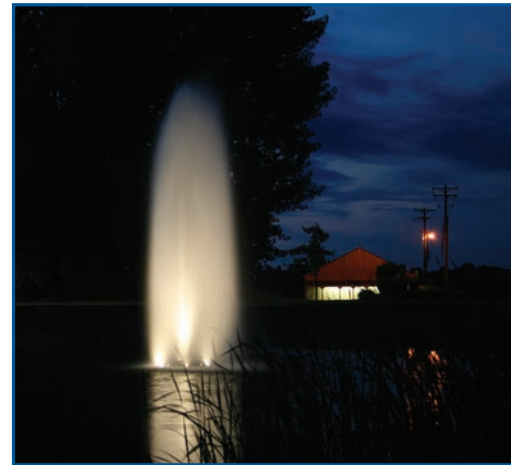
LED Light kit on 5 HP sequoia nozzle