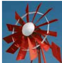
20' Traditional Tower Red & White PCW0006 (276 lbs.)